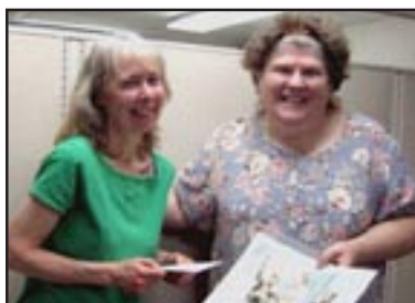
Thanks for a job well done!